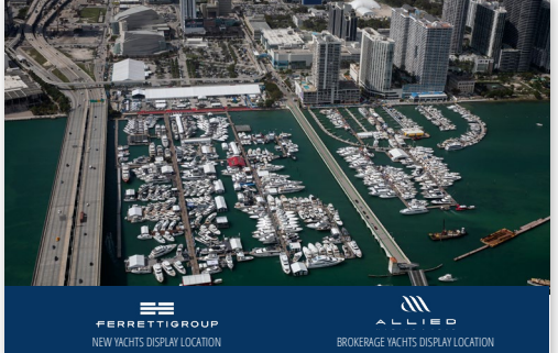
ONE HERALD PLAZA

Features boats up to 49 feet, engine manufacturers, marine accessories, electronics, and retail pavilions.