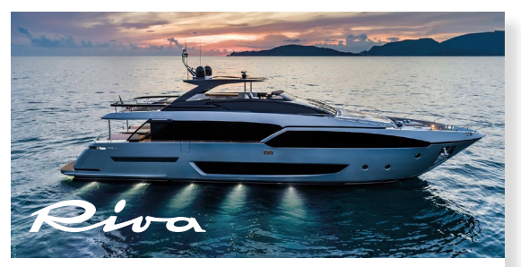
RIVA 90' ARGO