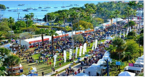
COCONUT GROVE ARTS FESTIVAL 2700 S. Bayshore Drive, Miami, FL 33133 & 7 miles to show

Coconut Grove has long been considered Miami's original art district. The Coconut Grove Art Festival is held Presidents' Day Weekend: February 18 -20. Opening 10:00 a.m. each day of the festival and closing On Saturday and Sunday at 6:00 p.m. and on Monday at 5:00 p.m.