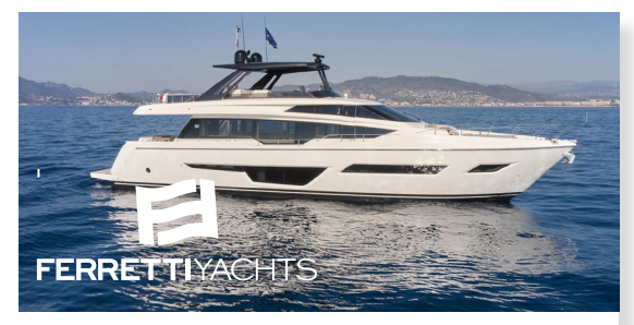
FERRETTI YACHTS 780