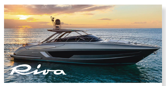
RIVA 56' RIVALE