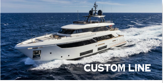
CUSTOM LINE NAVETTA 33